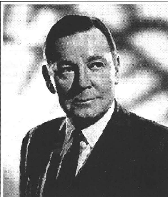
Herbert Marshall 1890 - 1966

In “The Big Lie”, broadcast October 1, 1951, Thurston pursues foreign agents engaged in operating a rumor factory somewhere in Chicago -- “organized to